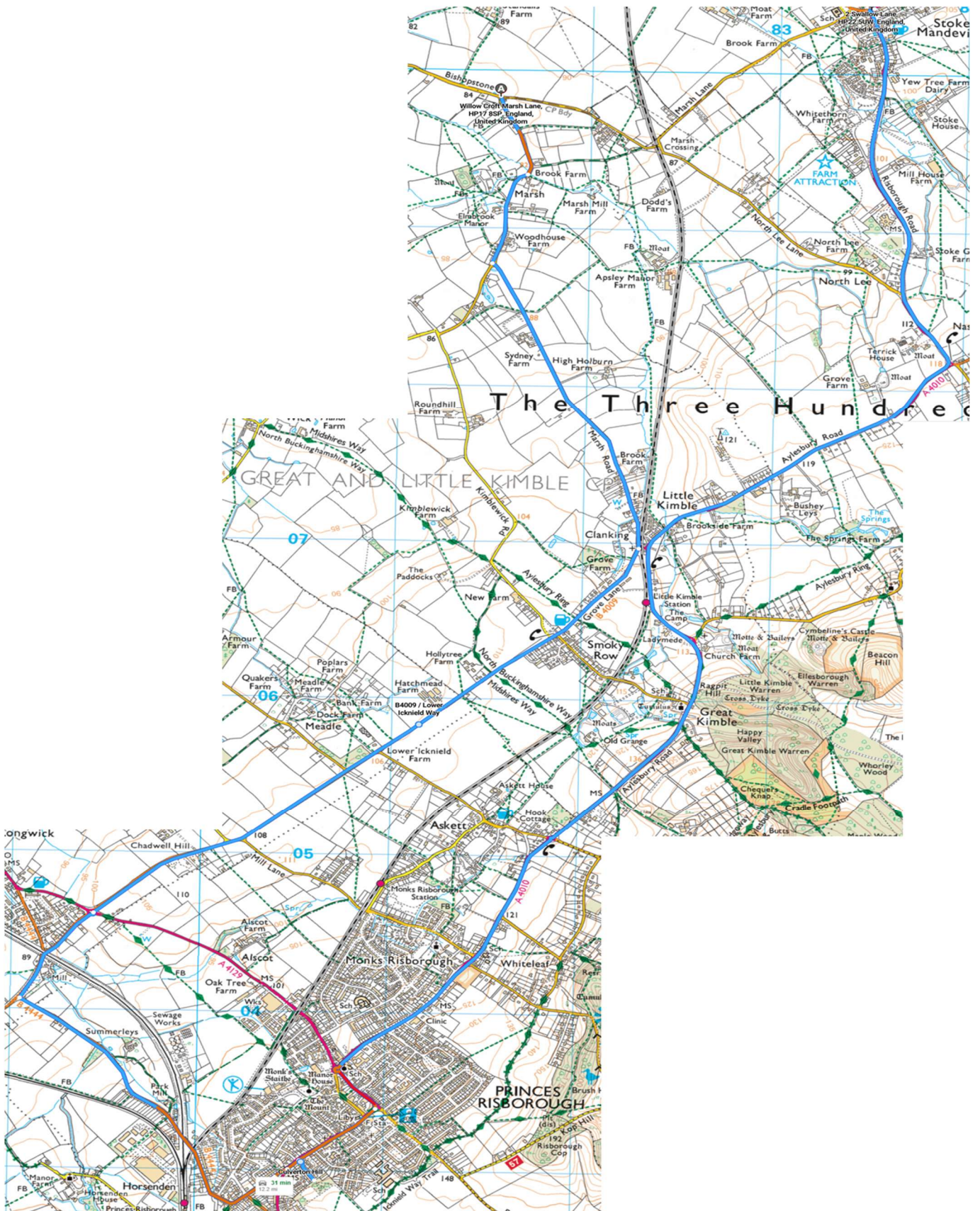
Images sourced from Bing Maps using Ordnance Survey imagery.