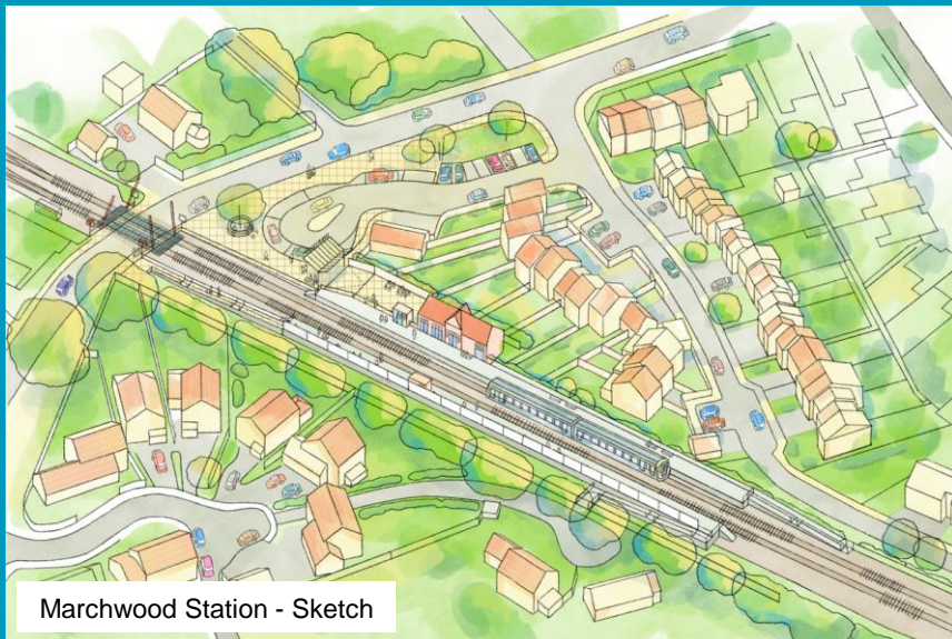
Marchwood Station - Sketch