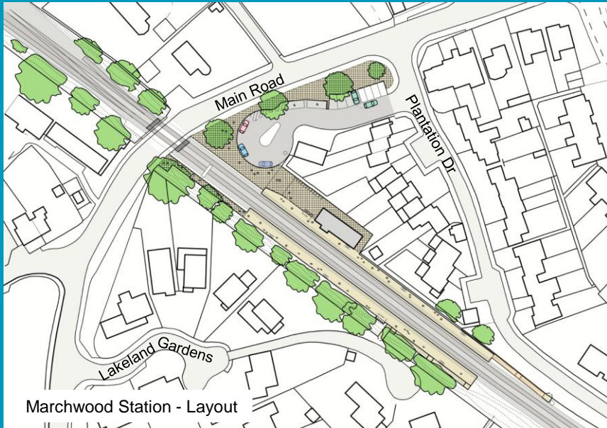
Marchwood Station - Layout