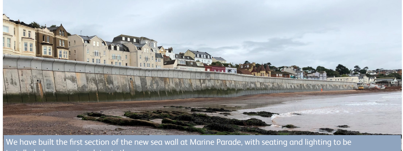
installed when we return later in the year

The first section of the new Dawlish sea wall has now been built, with the beach and promenade reopening on Tuesday 28 July. The footbridge to Boat Cove reopened slightly earlier on Friday 24 July, while the car parking spaces along Marine Parade are now available for public use once again.