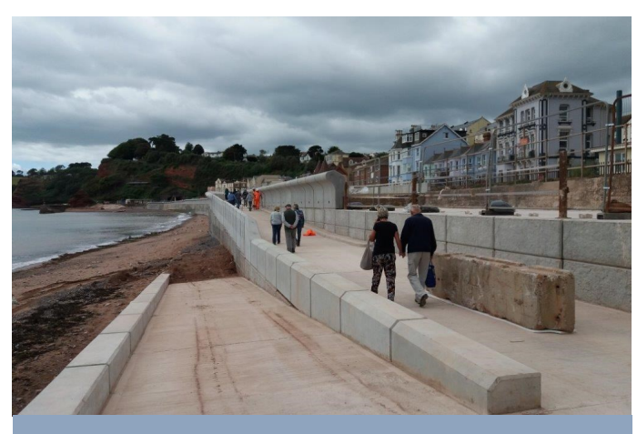
The new, wider promenade is much safer and more accessible thanks to the new ramp.

This area is still open to the public and we expect to begin work on the second section later this year, if our plans receive consent.