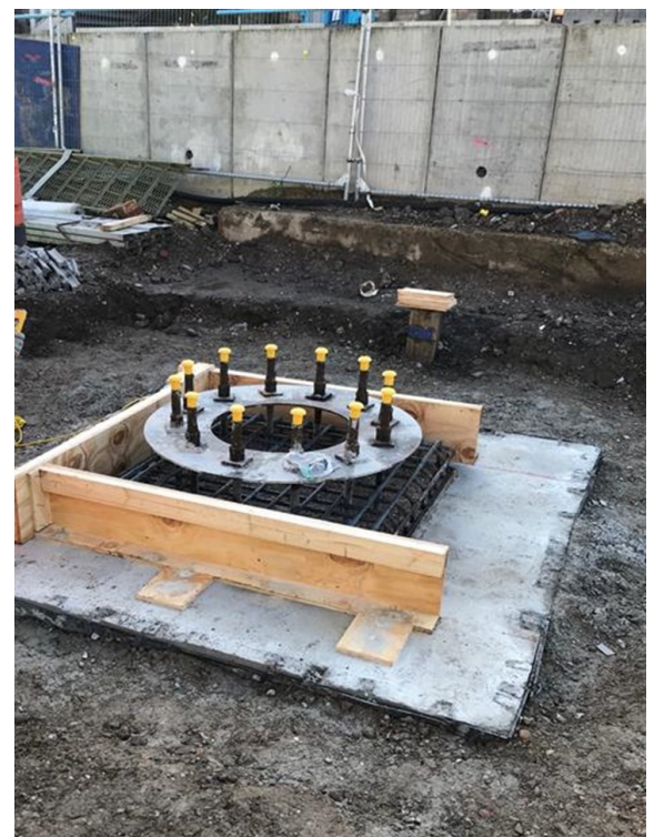
West Drayton - pile cap installation

At West Drayton we started fabrication of the steel reinforcement for the lift shaft foundations. We have continued breaking the tarmac in preparation for the north lift pit installation. We have begun installing pile caps for the new building steel work and continued excavation for the drainage works.