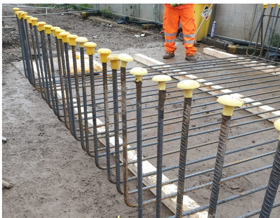
West Drayton - fabrication of lift steel reinforcement

In advance of piling for the new station building structure, we have continued with essential ground preparation works