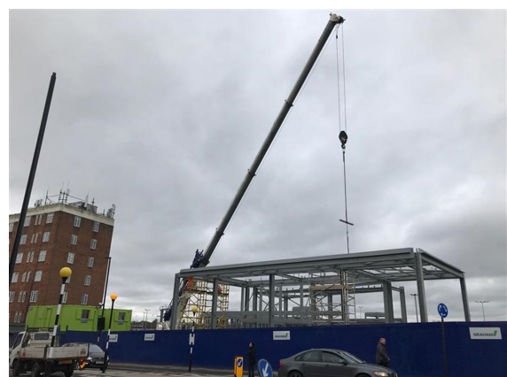
Acton Main Line - main steel installed