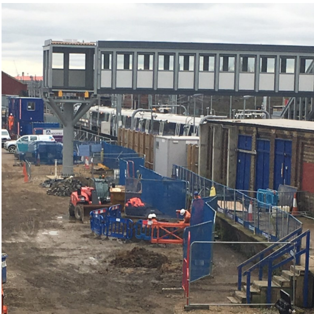
Southall - ground preparation works for piling

At Southall we commenced the trial holes for the drainage works.