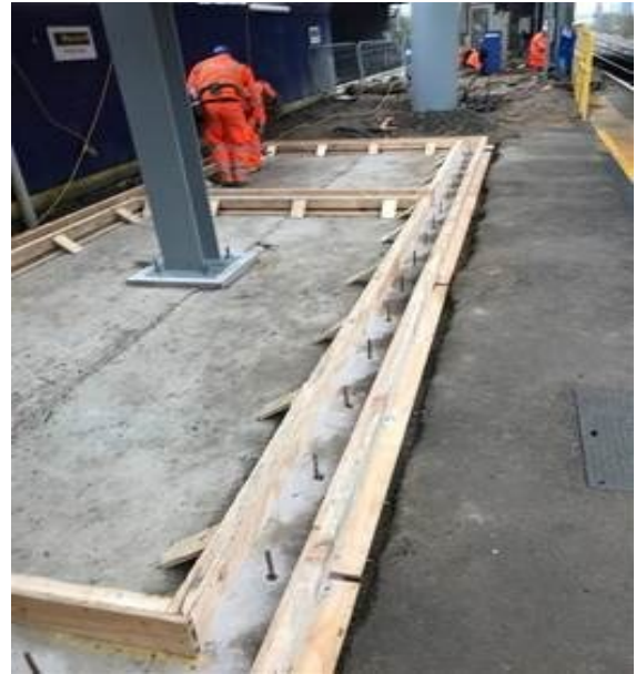
Hayes & Harlington - lift motor room formwork

We commenced demolition of the Station Road staircase. We continued construction of platform 2 and 4 lift motor rooms and piling for the new station building structure and foundations.