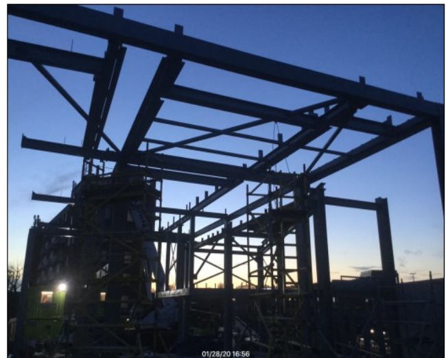
Acton Main Line - main steel installed

At Ealing Broadway we continued installing the platform 2/3 lift walls and finished tiling of the new concourse. We have started demolition of the old concrete slab front canopy and commenced installing hoarding on the link bridge between platforms 2/3 and 4 to create a safe passenger diversion whilst works continue on the new link bridge.