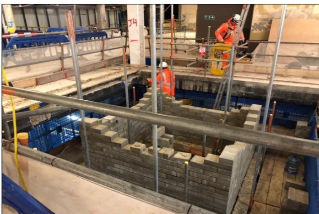
Ealing Broadway - installing the platform 2/3 lift walls

At Ealing Broadway we continued installing the platform 2/3 lift walls and finished tiling of the new concourse. We have started demolition of the old concrete slab front canopy and commenced installing hoarding on the link bridge between platforms 2/3 and 4 to create a safe passenger diversion whilst works continue on the new link bridge.