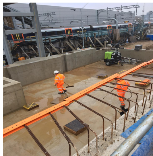
West Ealing - the basement concrete slab

At West Ealing the basement concrete slab construction has been finished, we have backfilled the north retaining wall to Manor Road level and installed drainage. Preparation works for installing the main steelwork are now underway.