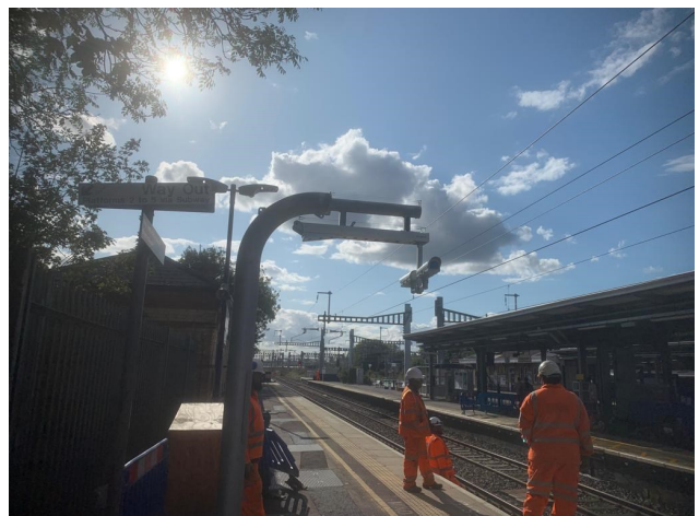
DOO cameras being installed