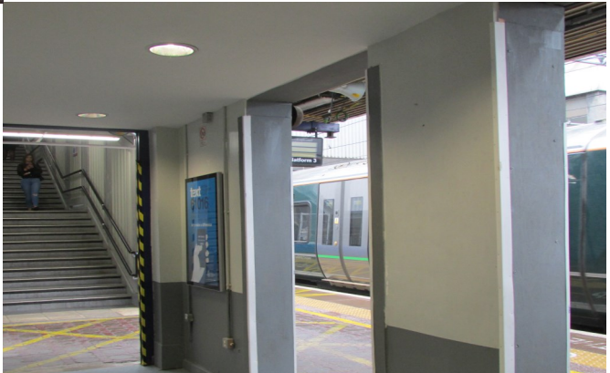
Waiting room remodelled at Ealing Broadway by GRAHAM

At Ealing Broadway , we have completed the temporary remodelling of the waiting room to ease passenger congestion at the bottom of the stairs on Platform 3.