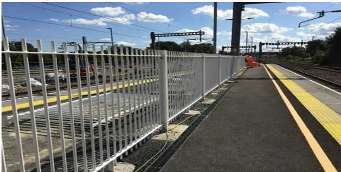
West Drayton platform extensions

At West Drayton we have almost finished construction of the platform extensions, completed installation of temporary lighting and FCL are commissioning the DOO system ahead of programme.