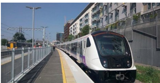
Elizabeth line train

TfL Rail is now trialling the longer nine-carriage trains on the western route between Paddington and Hayes & Harlington. Currently, only seven-carriage trains are being used but the nine-carriages will be used when the full Elizabeth line is open. All the new TfL trains have climate-control, walk through carriages, wifi and 4G