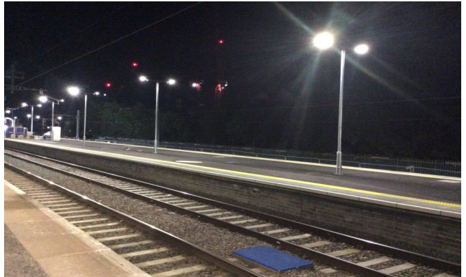
Lighting installed by FCL at West Drayton

We have been making excellent progress with the installation of the Driver Only Operated (DOO) CCTV system at a number of stations. This system will continue to be installed and tested throughout August. At Slough , we have been continuing with the platform extensions, surfacing works and DOO. At Maidenhead we have prepared the ground for the platform extensions to start