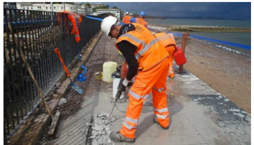
Ground investigations are being carried out

'Targets' were also installed along the top and