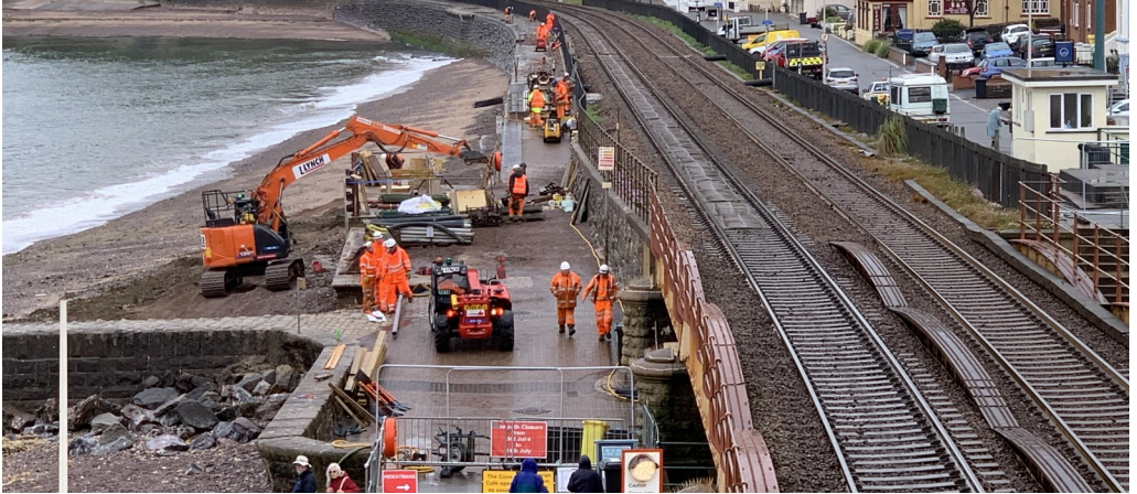
The Orange Army continue to work around tide times to access the beach and sea wall

Since the last residents' update, work has picked up pace on the construction of the new sea wall from Colonnade underpass to Boat Cove.