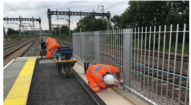
West Drayton platform extensions—final touches

We are continuing to upgrade the main line stations in your area, bringing passengers the benefit of enhanced accessibility with lifts and footbridges that will bring step-free access to all platforms and to enable the full introduction of the new Elizabeth line trains (Class 345s) and the GWR Electrostar trains (Class 387s).