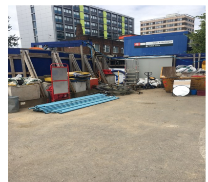
Contractor Hochtief set up site at Hayes & Harlington