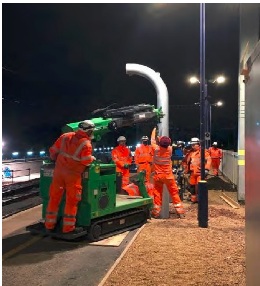
Post installed at Langley ready to install DOO Camera