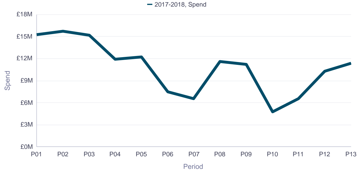
Spend by Period