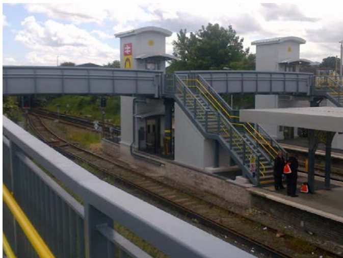
Birkenhead station following completion (Funded by: European Regional Development fund, DfT, and Mersytravel)

As a result of extensive stakeholder consultation, and in keeping with the regulatory requirements, Network Rail has developed a number of template agreements for the range of services it provides. The company is continuously reviewing and improving these template agreements with the aim of providing promoters with transparency on payments to Network Rail and on the company's obligations and accountability.