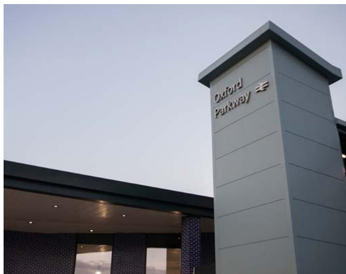
Oxford Parkway Station; Funded by Chiltern Railways and Network Rail