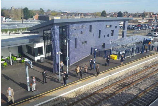
Bicester Village Station; Funded by Chiltern Railways and Network Rail