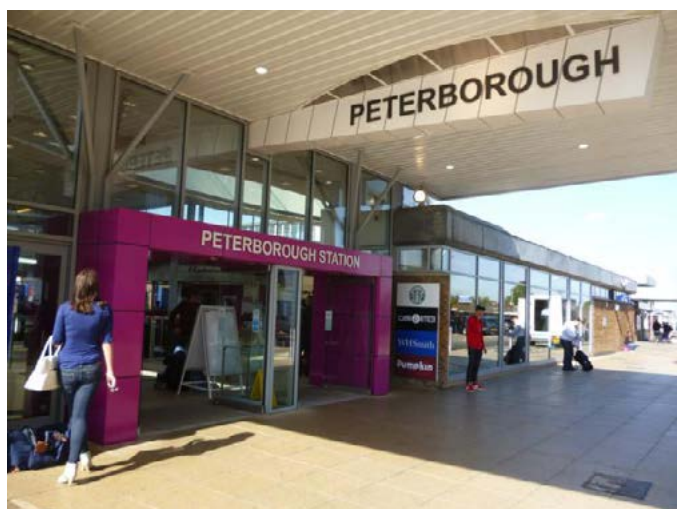
Peterborough station following completion of a National Stations Improvement Programme project

These standards must be considered when developing station schemes, in addition to those processes that relate to station access contracts and leases.