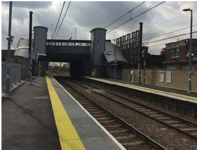
Lea Bridge Station – a new station (Funded by: Waltham Forest Council and the New Stations Fund)