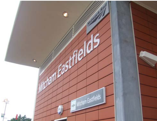
Mitcham Eastfields - new station (Funded by: Network Rail)