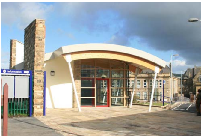
Accrington eco-station redevelopment (Funded by: Lancashire County Council, Hyndburn Borough Council, National Stations Improvement Programme and European Regional Development Funding)