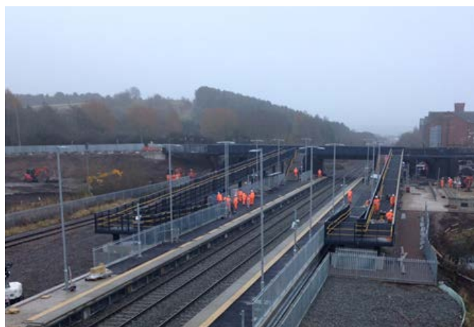
Ilkeston Station under construction in early 2017 (Funded by: New Stations Fund, Derbyshire County Council, and Erewash Borough Council)

A number of new stations have been delivered and financed by Network Rail. In such circumstances funds for the project have been provided by Network Rail in return for a stream of regulated charges paid by the TOC. Where financial support from the DfT is required it is often paid to the TOC in the form of increased subsidy or reduced premium payments.