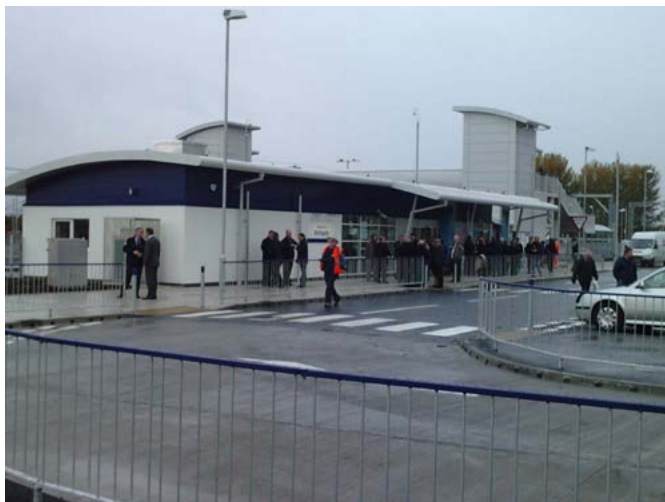
Bathgate - new station (Funded by: Transport Scotland)

National legislation applies and this contains specific reference to sub-surface stations. Whilst this was primarily drafted to apply to underground stations, it nonetheless applies to a number of Network Rail's stations, particularly those beneath major developments. Advice should always be taken from Network Rail's Fire Safety Engineer.