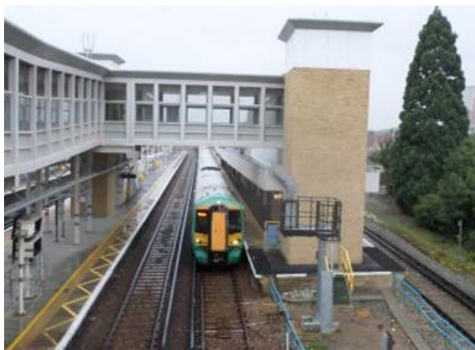
New Cross Gate Station, Access for All fund