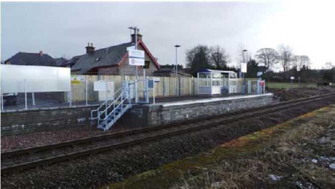
Conon Bridge - new station with an innovative short platform (Funded by: Highland Council, HiTRANS, Network Rail and First ScotRail)

Table 5.3 sets out a checklist of issues and key considerations concerning operations and performance.