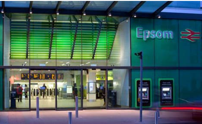
Epsom station redevelopment (Funded by: Network Rail and Kier Property)

This chapter provides guidance for developing a proposal to invest in an existing station.