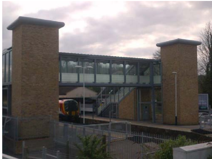
Winchester station following completion of an Access for All project