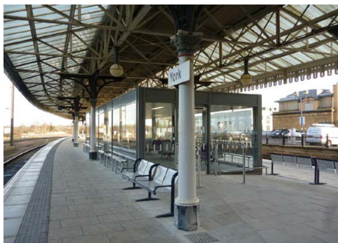
York station following completion of the National Stations Improvement Programme project