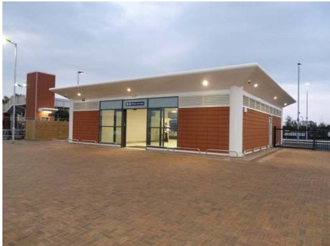
Buckshaw Parkway - new station (Funded by: Lancashire County Council, Chorley Council and Network Rail)

Table 5.2 sets out a checklist of the commercial and economic issues and key considerations.