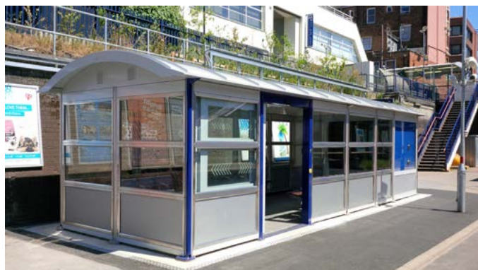
West Hampstead station following completion of a National Stations Improvement Programme project: waiting room and customer service facility.

The overall aim of this exercise is to make it easier for promoters to do business with Network Rail. The template agreements can be found on the Network Rail website: