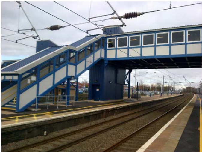
St Neots following a completion of an Access for All scheme (Funded by: Huntingdonshire District Council, Access for All and Network Rail)

The rail industry is made up of a number of different entities and the industry's planning framework has undergone a number of changes in recent years. This section clarifies the accountabilities of the different organisations and the relationships between them, and identifies particular policies of relevance to promoters of investment in stations. Industry structure is illustrated in Figure 6.1