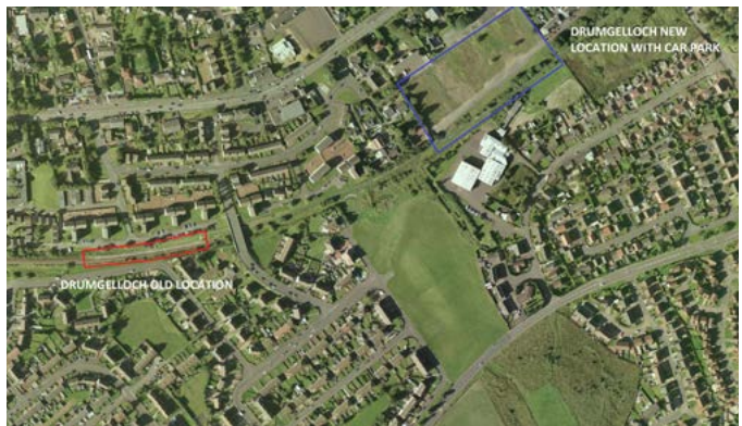
Relocated Drumgelloch station (Funded by: Transport Scotland)

This chapter provides guidance for developing a proposal to replace or relocate an existing station.