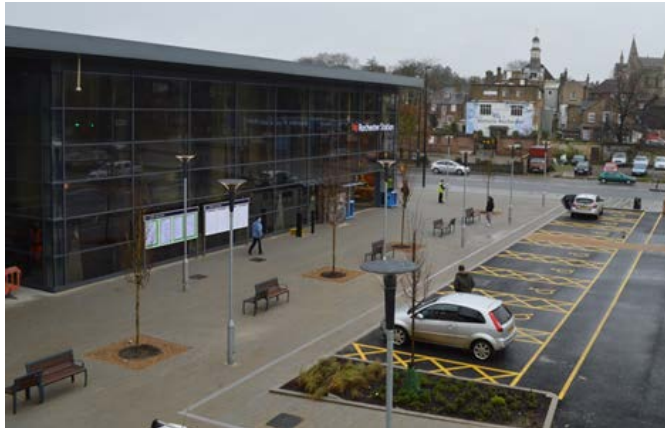
Rochester Station – a relocated station funded by Network Rail