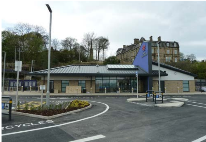
Burnley Manchester Road - redeveloped station (funded by Burnley Council, Lancashire County Council and European Regional Development fund)