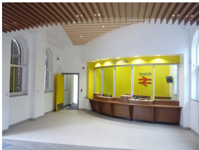
Ormskirk station redevelopment. This project was funded by: Lancashire County Council, Merseytravel, Railway Heritage Trust, West Lancashire Borough Council, Northwest Regional Development Agency (NWDA) and National Stations Improvement Programme