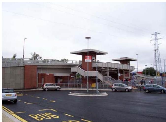
Coleshill Parkway new station (Funded by: Laing Rail, DfT through LTP, Warwickshire County Council and North Warwickshire District Council)

The rail industry LTPP is the thirty year strategy for the rail network in Great Britain. It is comprised of three different elements which together define the future capability of the rail network. Market Studies forecast future rail demand and develop conditional outputs for future rail services, based on stakeholders' views of how rail services can support delivery of the market's strategic goals. Route Studies, which replace the established geographical Route Utilisation Strategies (RUSs), develop options for future services and for development of the rail network, based on the conditional outputs and demand forecasts from the market studies, and assess those options against funders' appraisal criteria in each of Network Rail's devolved Routes. Route Studies inform the development and delivery of timetables, infrastructure maintenance and renewals for the network. Cross Boundary analysis considers options for services that run across multiple routes to ensure that consistent