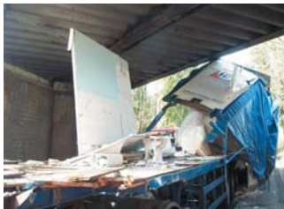
A damaged trailer and load

Your company may lose their operator's licence.