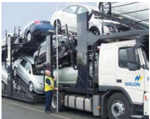
Always check the maximum height of your vehicle, its load and equipment.

A route and vehicle check pro – forma is provided for your use to record checks carried out to aid the prevention of bridge strikes.