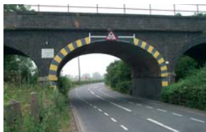
White lines on the road indicating the extent of the signed vehicle height limit

White lines on the road and 'goal posts' on the bridge may be provided at arch bridges to indicate the extent of the signed limit on vehicle dimension, normally over a 3m width. There may be two or more sets of 'goal posts' showing different heights through an arch.