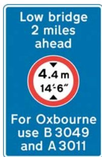
Advance warning of a prohibition ahead

You should be aware however that advance warning signs are not provided at all low bridges.