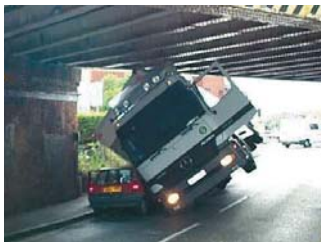
A crushed car as a result of a bridge strike

This good practice guide is intended to provide advice to professional drivers on the risks and consequences of bridge strikes, and to give guidance so that bridge strikes may be prevented.