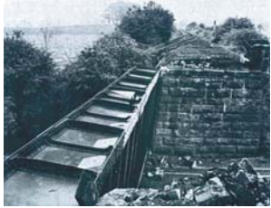
A bridge strike can seriously damage railway bridges