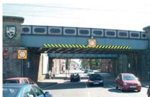
Warning chevrons and circular signs at girder bridge