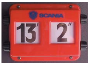
Height notice in the cab

If your vehicle is higher than the dimension shown on a triangular road sign at a bridge, you should not pass the sign.